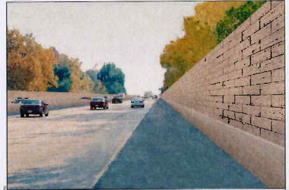
The rendering above shows the auxiliary lane project which shifts through lanes to the center median, and includes auxiliary lanes and sound walls to the outside.

2580 Sierra Sunrise Terrace, Suite 100 Chico Ca, 95928 530-879-2468 www.bcag.org www.buttehcp.com www.BlineTransit.com